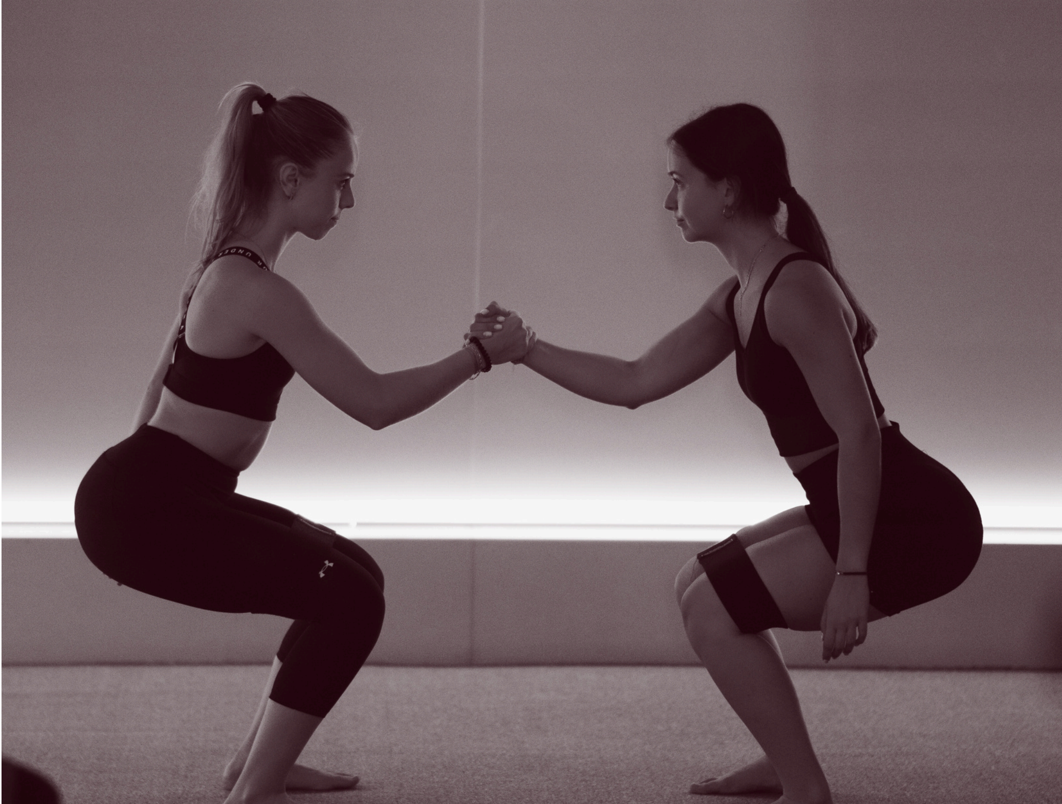
TABLA DE CONTENIDOS